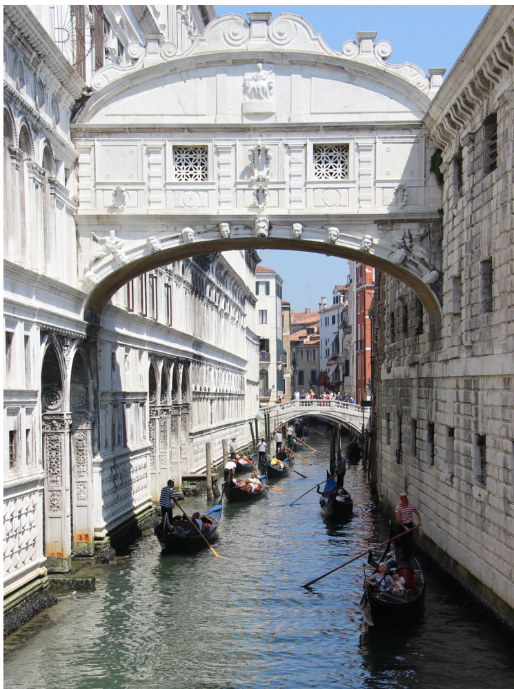
Maybe Italy is your choice destination?