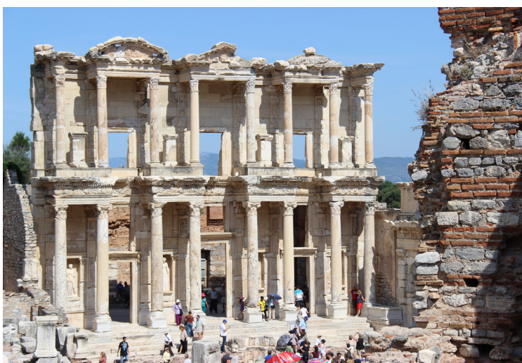
Discover history you never knew existed