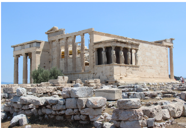
Perhaps a visit to Greece on a Rotary Euro Tour?