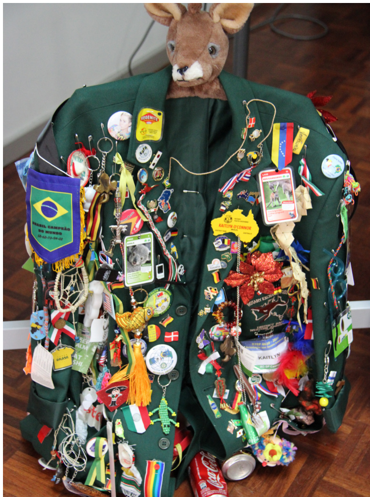
Prized possession...Your Rotary Blazer