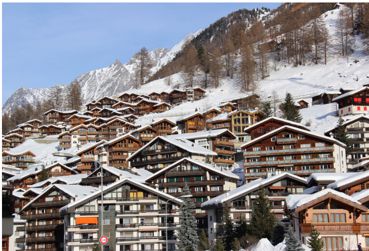
Maybe enjoy A European Winter?